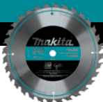
TABLE SAW BLADES