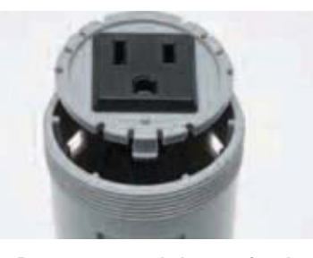
8. Remove receptacle by pressing three tabs located on side of tube.

Align the three latches on the low voltage plate with the three latch holes in the round floor box tube.