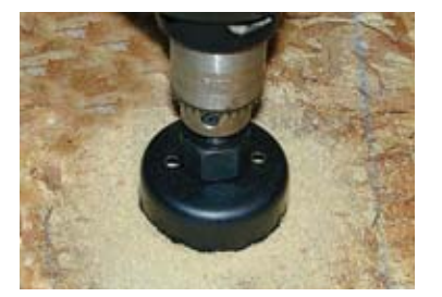
2. Drill hole in floor using hole saw.