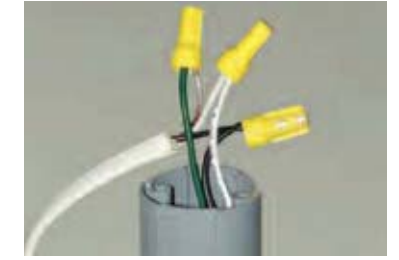
4. Connect receptacle wires to cable. Be sure to match wire colour(s).