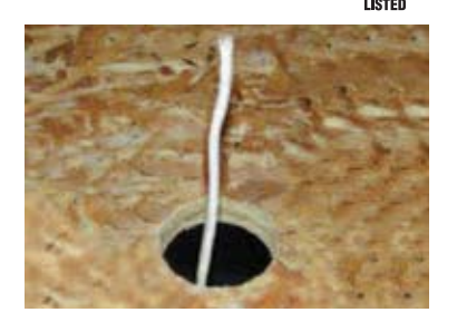
3. Pull cable through floor.