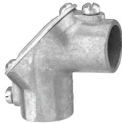
-G: with gasket.