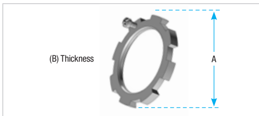
Steel or malleable iron (steel thru 2 in.)

Use anywhere an ordinary locknut is installed to ensure positive bonding of conduit to box and prevent loosening due to vibration. Also can be used for Service Entrance applications in conformance with Code. T&B rigid conduit and EMT (thinwall) fittings comply with Federal Specification WF 408c.