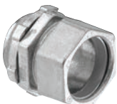
Zinc Die Cast Locknut IT: with insulated throat