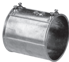
CI5120 / CI5132