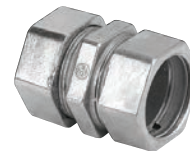
CI5904 / CI5932