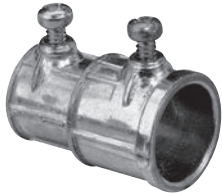
CI5164 / CI5168