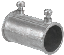
CI5104 / CI5116