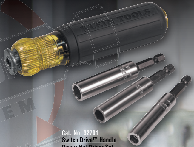
Cat. No. 32701 Switch Drive™ Handle Power Nut Driver Set