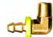
90° ELBOW Hose To Male Pipe