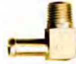
90° ELBOW Hose Barb To Male Pipe