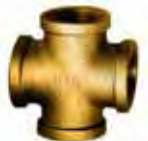
CROSS (Cast Bronze)