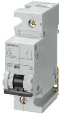
Miniature circuit breaker 230/400 V 10kA, 1-pole, B, 125 A, D=70 mm