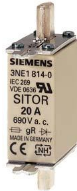
SITOR fuse link, with blade contacts, NH000, In: 16 A, gS, Un AC: 690 V, Un DC: 250 V, front indicator