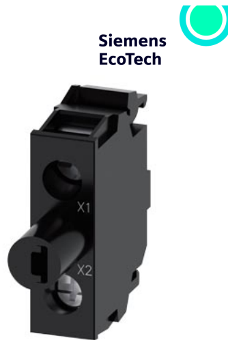
LED module with integrated LED 110 V AC, red, screw terminal, for floor mounting