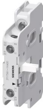
Auxiliary switch block, for size 3...12 2nd auxiliary switch block left or right