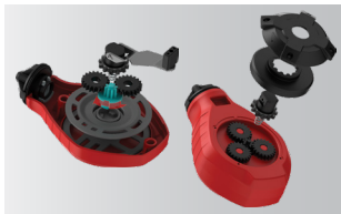
StripGuard™ Clutch & Planetary Gears