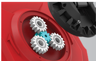
Planetary Gears Prevent Stripping