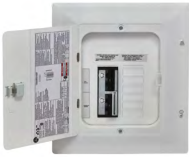
CBRPL112G3 (with cover)