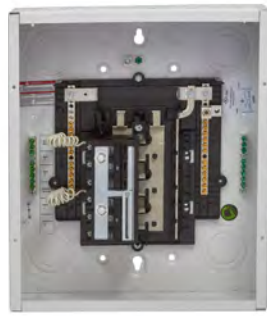
CBRPL112G3 (without cover)