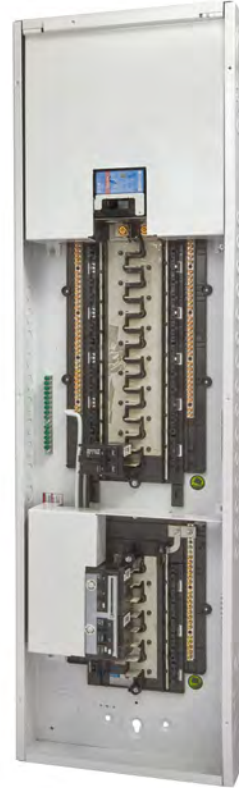
CBRPM236GEN (without cover)