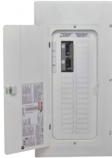
CBRPL130G6 (with cover)