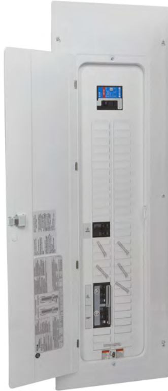
CBRPM236GEN (with cover)