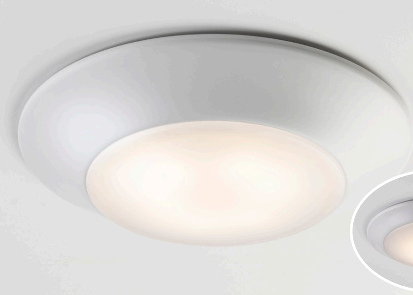
MODEL SHOWN: DL4-12W-WH