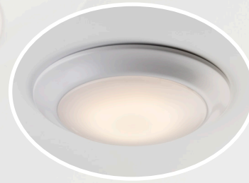
MODEL SHOWN: DL6-15W-WH