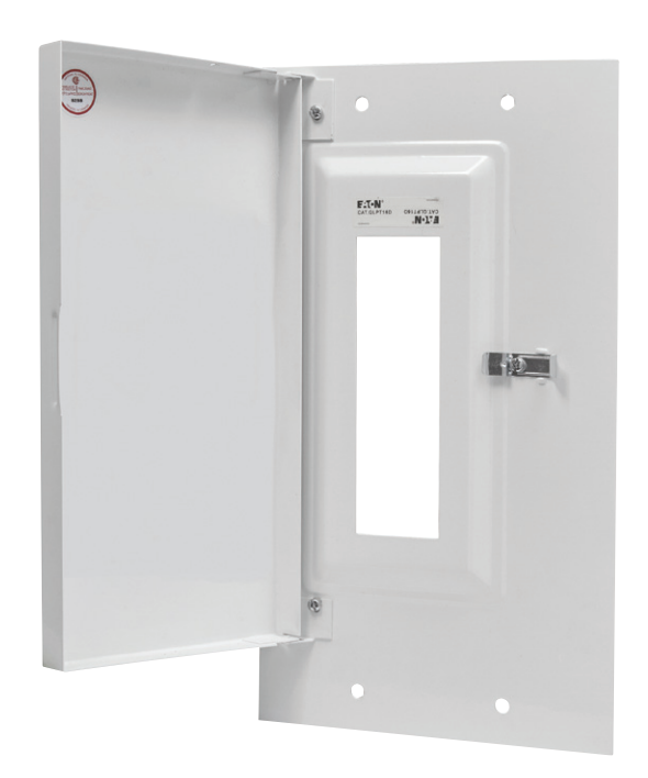
QLPT16DW (Door Open)