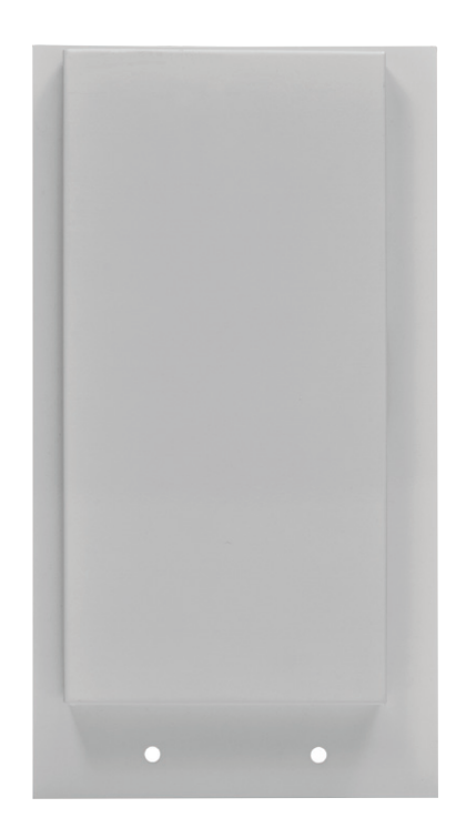
QLPT16DW (Door Closed)