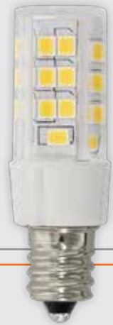
E 12 E12-CR45LEDA