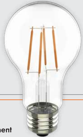
A19 Filament VO-FA19W7-120