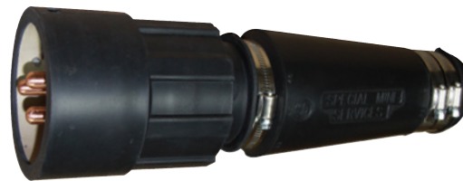
Male Cable Attachable