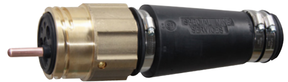
Female Cable Attachable