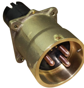
Male Panel Mount