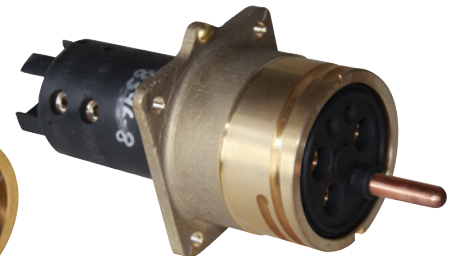
Female Panel Mount