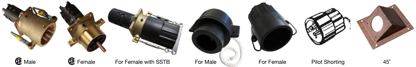
Male Female For Female with SSTB For Male For Female Pilot Shorting 45°

Pro caps with Stainless Steel Turn Buckles, ADD SSTB to the part number indicated