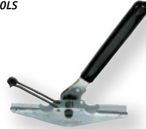
P-38 Economy Tool