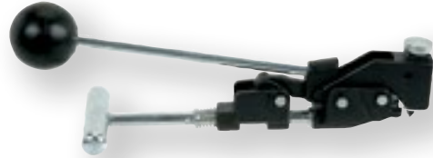
P-1 Service Tool