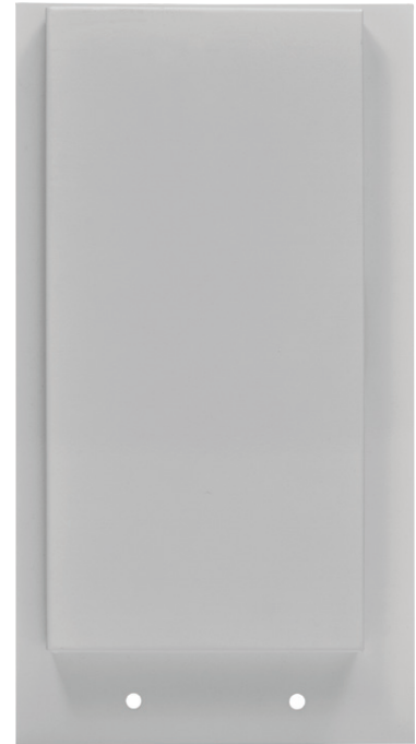
QLPT16DW (Door Closed)