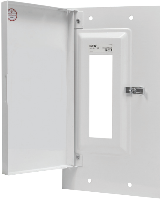
QLPT16DW (Door Open)