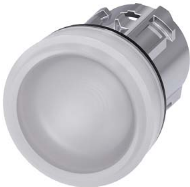
Indicator lights, 22 mm, round, metal, shiny, white, lens, smooth