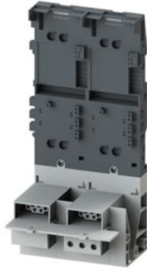
130 mm terminal module for ET200S High Feature Reversing starter without supply line connection