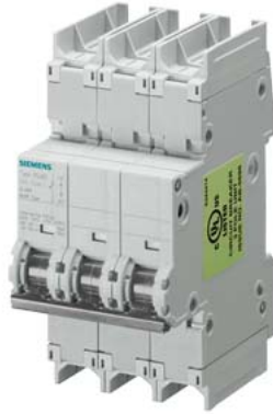
Miniature circuit breaker 240 V 14kA, 3-pole, C, 2A, D=70 mm according to UL 489