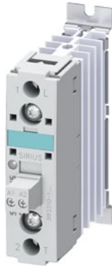
Solid-state contactor 1-phase 3RF2 AC 51 / 10 A / 40 °C 48-460 V / 24 V DC screw terminal