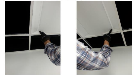
Using one finger, depress the corners of the lens where the lens meets the rails. Locate the side that does not contain spring clips. This side will depress easier than the side containing the clips.