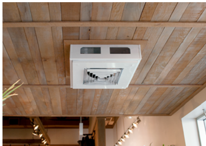
DRII MODEL - SURFACE MOUNTED