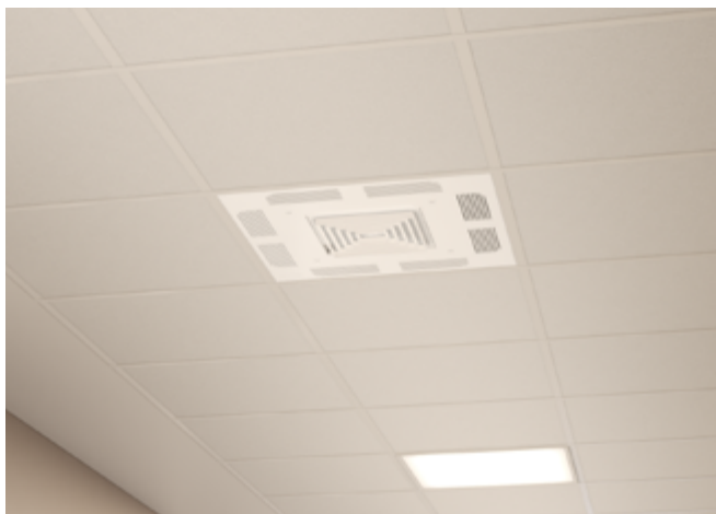
DRR MODEL - RECESSED