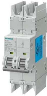
Circuit breaker 10kA, 2-pole, C, 4 A according to UL 489-480Y/277V