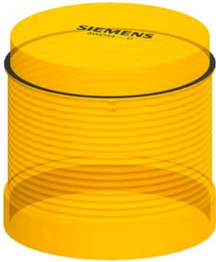
Single-flash light element, w. built-in electronic flash, yellow, 115 V AC, Diameter 70 mm