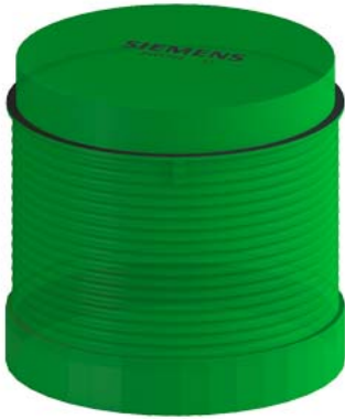
Single-flash light element, w. built-in electronic flash, green, 115 V AC, Diameter 70 mm