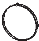
Y92S-28 Time Setting C