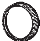
Y92S-27 Time Setting A