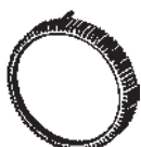
Y92S-28 Time Setting B