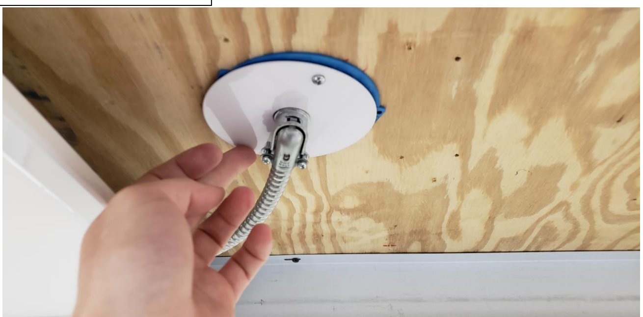
5. Push fixture all the way in and fasten the remaining end cap.