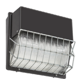
WG - Wire guard