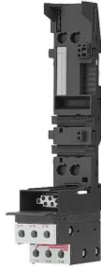
Terminal module for ET 200S DS for DOL starter with supply line connection