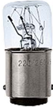
Incandescent lamp, 24 V AC/DC, 5 W, Base BA 15d, accessory for signaling columns, with diameters 50 mm + 70 mm, (Packing unit 10 units)