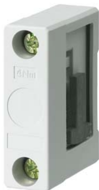
N/PE busbar support F R flat copper profiles for 5/10 mm busbars