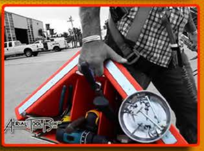
*Tools sold separately