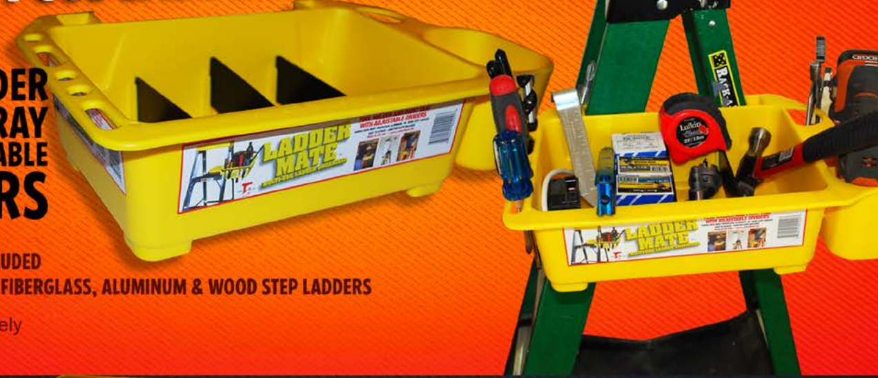
*Tools sold separately