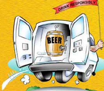
Part# RV025 - 25 lbs 3 Pack