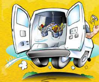
Part# RV050 - 50 lbs 2 Pack