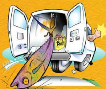
Part# RV010 - 10 lbs 4 Pack