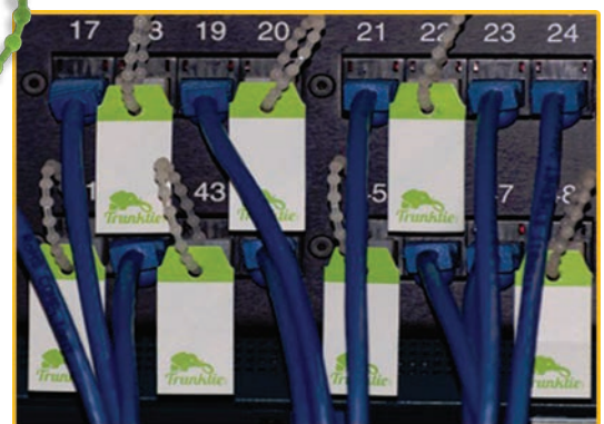
Part # 75065 (Pack of 25)

Trunkties plug into an unused port, providing a flexible cable that secures into a multipurpose loop. That's all, it's that simple.