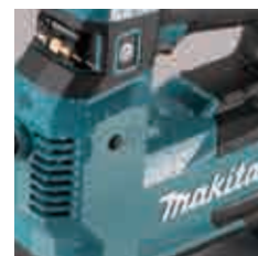
XPT eXtreme Protection Technology