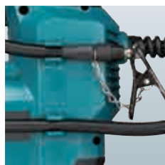
Storing hose The hose can be attached to the hose holder of the tool.