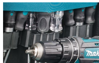
Tool Loops System inside the backpack