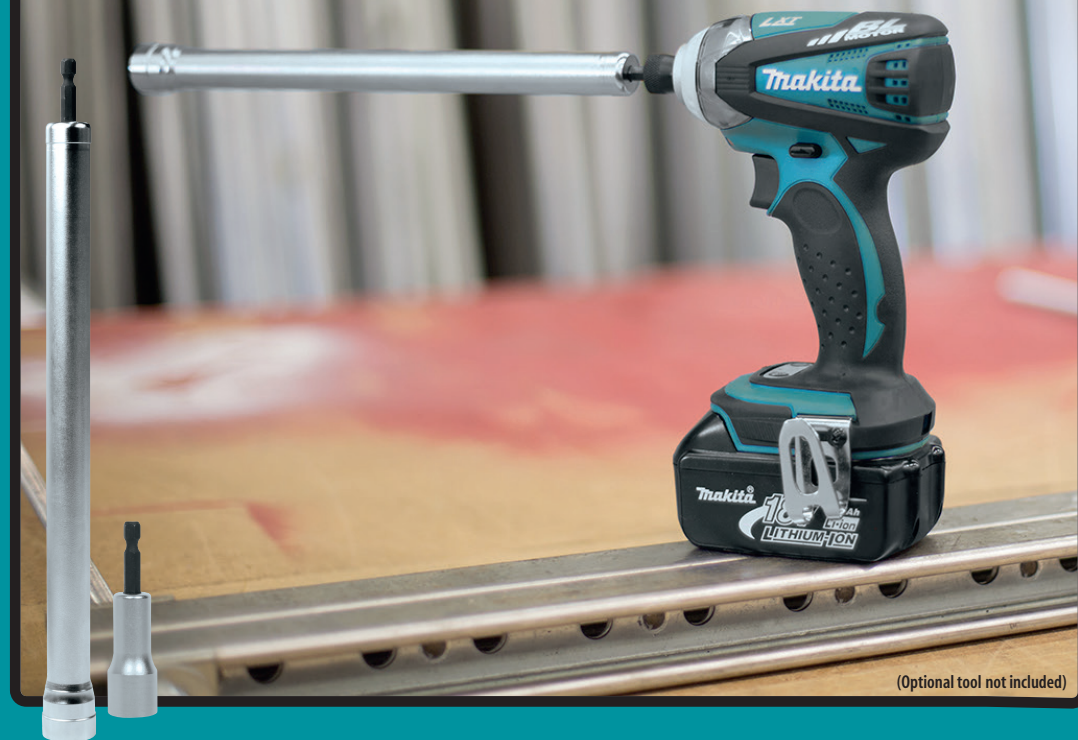
(Optional tool not included)