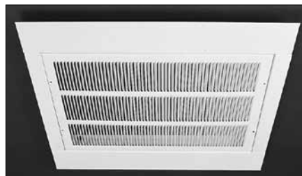
RFITF T-bar Ceiling Mount Trim (white only)