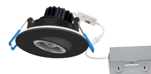
SLIM3GIM-5CCT BK (black)