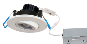
SLIM3GIM-5CCT WH (white)