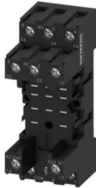
Plug-in socket for PT relay 3 changeover contacts screw terminal