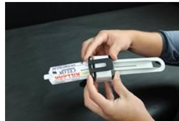
Push Collar to Snap in Place