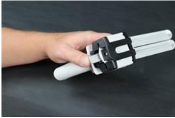
Lift Metal Tab