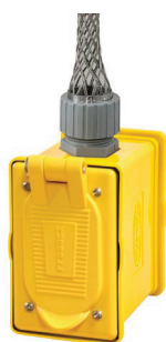
Deluxe Cord Grips (purchased separately)