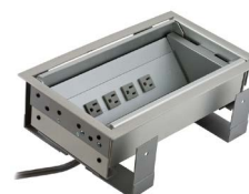
WSBG43USV (cover doors shown open)