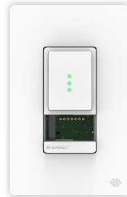
20/40/60 Timer Control Switch (S16008WA)