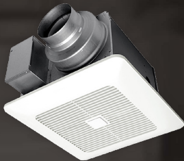
WhisperGreen® Select Fan