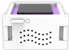
Air Quality Sensor (WI008UWA)