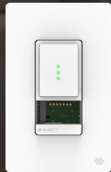
20/40/60 Timer Control Switch