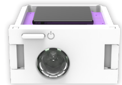
Motion Sensor (WI004UWA)