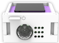
Temp/Humi/Motion Sensor (WI006UWA)