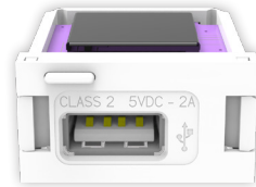
USB Charger (WI001UWA)