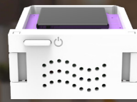
Air Quality Sensor