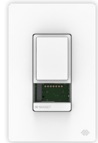
Auxiliary Control Switch (S16009WA)