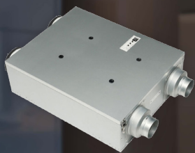
Intelli-Balance™ Energy Recovery Ventilator