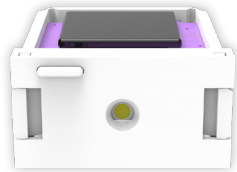
Power Out Light (WI003UWA)