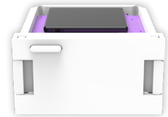
Power Control (WI000UWA)