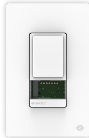
On - Off Switch (S16001WA)