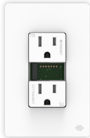
15A Outlet (R1015SWA)