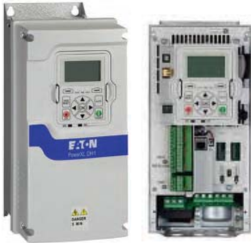
DH1 HVAC/R Drive