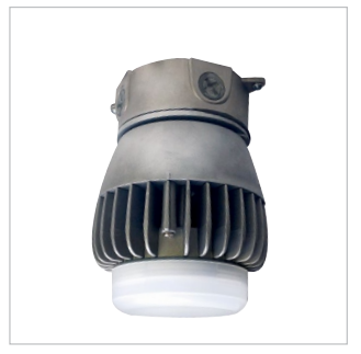
DVAKS2-LED Ceiling mount