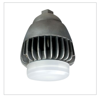
DVCS2-LED Pendant mount