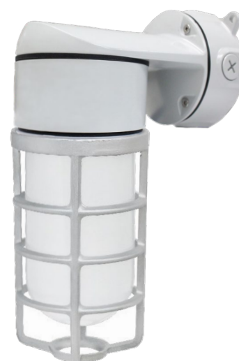
DVBKSX-LED14 shown with GD100CGS Cast Guard and GL100SB Sandblasted Globe.